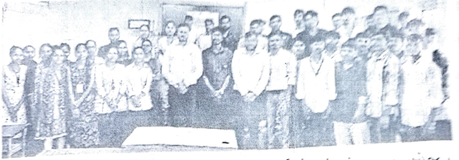
વાલોડ

વાલોડ : તા. 24 થી 25 માર્ચ 2026 દરમિયાન સરકારી વિજ્ઞાન મહાવિદ્યાલય, વાલોડ (જિલ્લો - તાપી) ખાતે "કસ્ટમર સેન્ટ્રિક ઈનોવેશન : વેલ્યુ પ્રોપોઝિશન" વિષયક દ્વિદિવસીય વર્કશોપનું સફળ આયોજન કરવામાં આવ્યું હતું. કોલેજ સમય દરમિયાન યોજાયેલા આ વર્કશોપમાં કુલ 53 જેટલા વિદ્યાર્થીઓએ ઉત્સાહભેર નોંધણી કરીને સક્રિય રીતે ભાગ લીધો હતો.